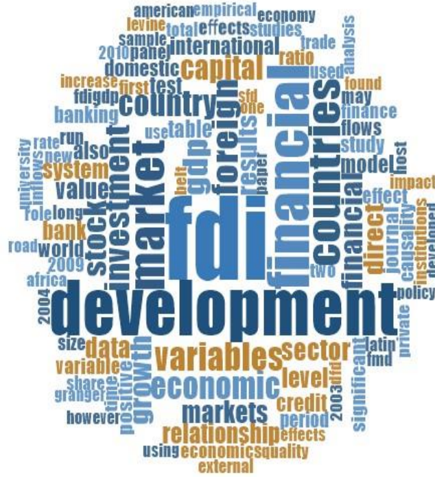
Figure 1: Word cloud for most common words in FD-FDI publications.

Using NVivo 12 plus, we constructed a word cloud of the paper under consideration. The cloud is presented in fig.2. NVivo presents most frequent words in biggest and bold fonts and lesser frequent words gain smaller fonts (Tseng et al., 2019). Thus word cloud presents the most common word which can help the researchers to identify the themes and keywords of the group of publications under consideration. Our observation found the word ‘FDI’ as the highest frequent word while ‘development’ and ‘financial’ gained the second and third rank with a weighted percentage of 2.04%, 1.29% and 1.05%, respectively. This does prove the correctness of journal selection for the current study.